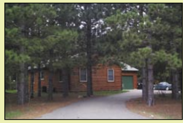
Log home in pines.