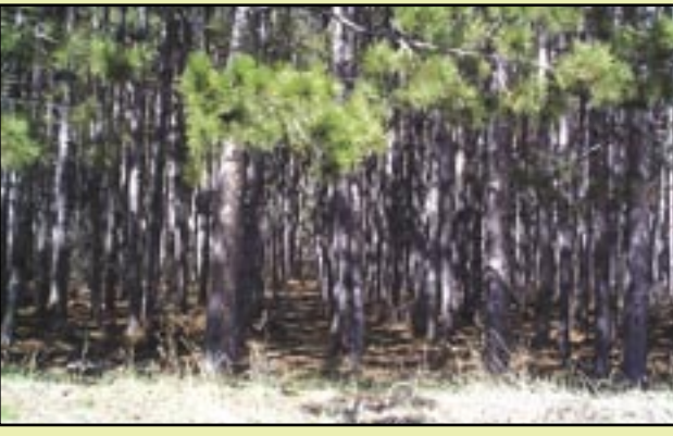
Pine rows need to be thinned.